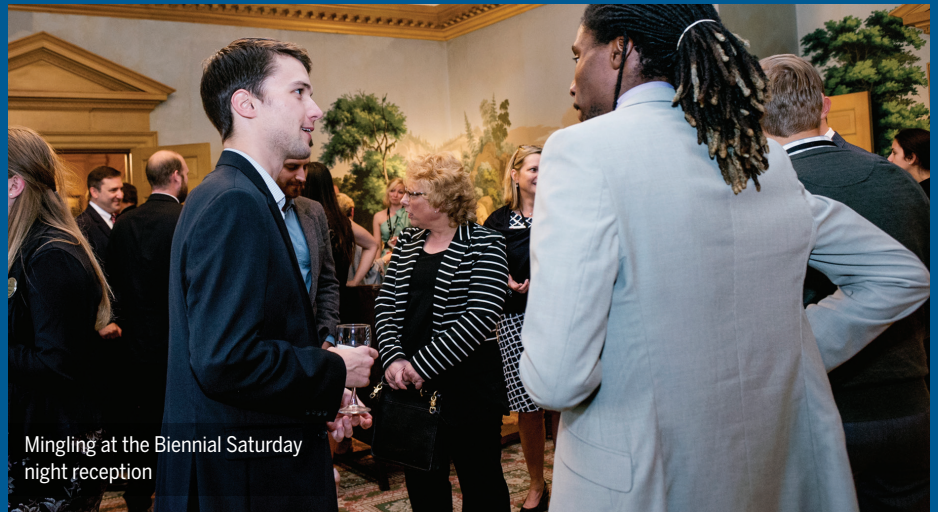
Mingling at the Biennial Saturday night reception