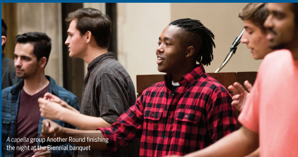
A capella group Another Round finishing the night at the Biennial banquet